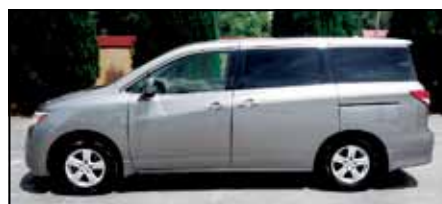
2012 NISSAN QUEST SV