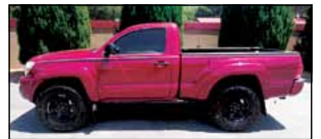
2008 TOYOTA TACOMA PRERUNNER

CALL FOR DETAILS ON THESE VEHICLES AND MORE!!