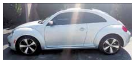
2012 VOLKSWAGEN BEETLE