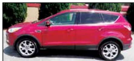
2013 FORD ESCAPE SEL