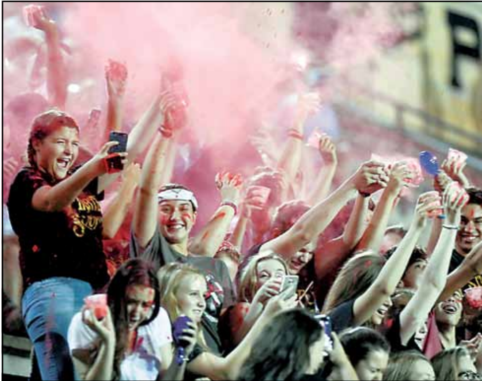
The Pasco faithful cheered the Pirates on but a second half surge from Wesley Chapel was too much to overcome.