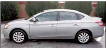
2014 NISSAN SENTRA