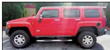
2008 HUMMER H3