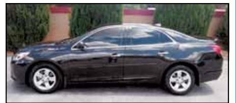
2014 CHEVROLET MALIBU LS