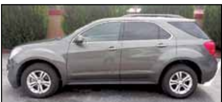
2013 CHEVROLET EQUINOX LT