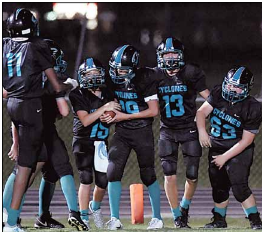
It was a defensive struggle between Centennial and Rushe middle schools last week.