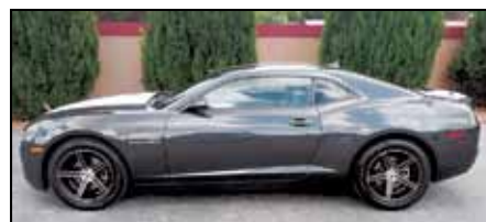
2012 CHEVROLET CAMARO LS