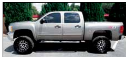
2013 CHEVROLET SILVERADO 1500 LT