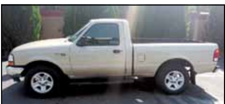
1999 FORD RANGER XLT