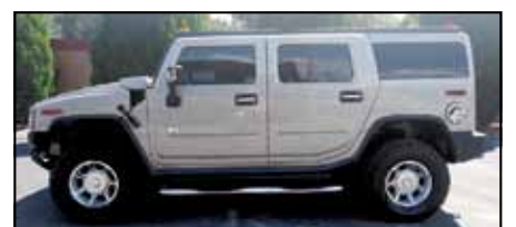
2006 HUMMER H2