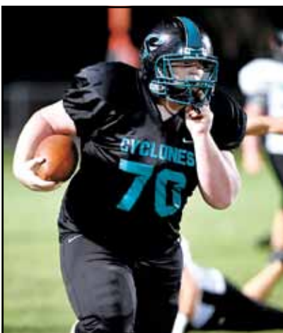
The Cyclones will face Weightman on Tuesday.

A 40-yard catch and run with less than four minutes remaining in the game made for the only score from both teams, securing