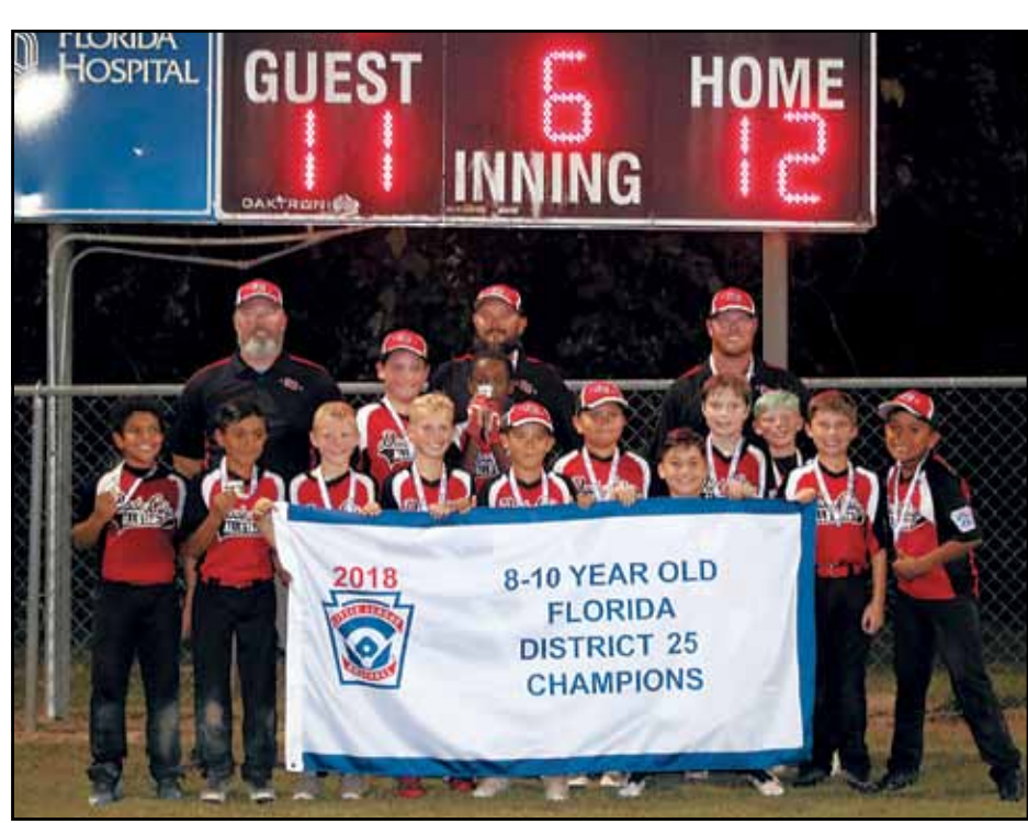
Dade City Little League is the 2018 District 25 8-10-year-old champions following a dramatic 12-11 win against Zephyrhills on Tuesday night.

"Fortunately, we came away with the win."